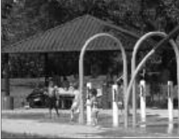
There are two pavilions available for rental at Plantation Woods.