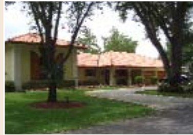
Plantation takes great pride in the abundance of beautiful residential neighborhoods.

The City of Plantation has an urban environment intermixed with a "hometown" lifestyle, achieved through thoughtful comprehensive planning and the vision and support of its City Council, staff and volunteer organizations. We invite you to learn more about the City of Plantation by visiting its website at Plantation.org .