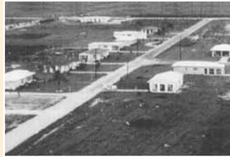
East Acre Drive.