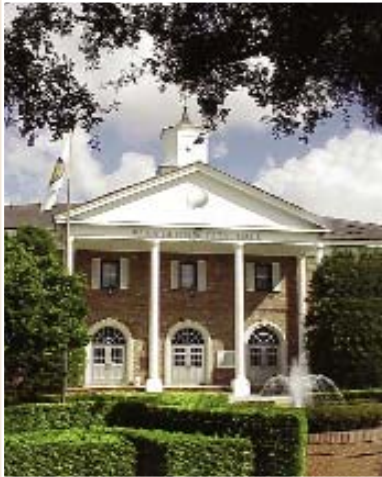
Plantation City Hall today.