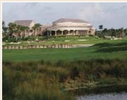
The Plantation Preserve Golf Course and trail is a Certified Audubon Cooperative Sanctuary, a protected wetlands and historical area.

This majestic public golf facility includes a beautiful clubhouse with banquet facilities, a linear trail that winds its way through the golf course and an Everglades-theme wetland preserve. The view from the restaurant overlooks the lush, green course.