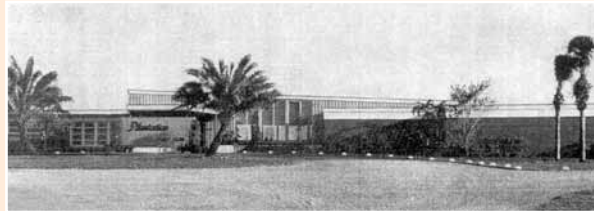
The Plantation Golf Club 1952.