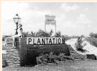
The historic stone entry way to the City.

The old stone entry ways have long been a City of Plantation tradition. Today, Old Chicago Brick marks City limits and the entrance in to many neighborhoods. Several City buildings have used the classic red brick, including City Hall.