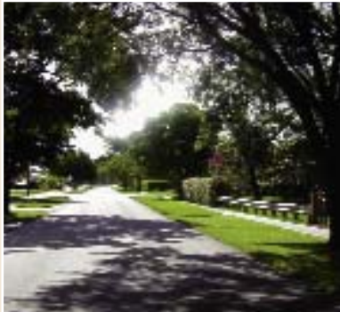
Plantation's tree canopy has become its signature trademark.