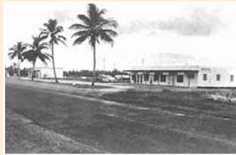
The original City Hall.