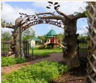
The City has many beautiful parks and playgrounds. Plantation Woods Park is a short walk from the Museum and has a water splash pad.