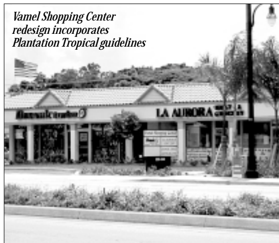
Vamel Shopping Center redesign incorporates Plantation Tropical guidelines