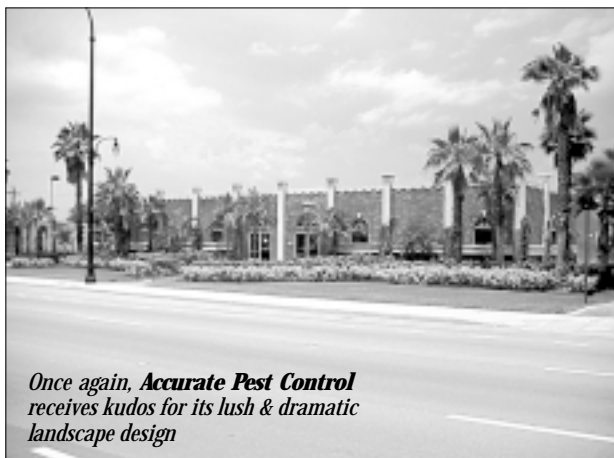
Once again, Accurate Pest Control receives kudos for its lush & dramatic landscape design

It is not surprising that Accurate Pest Control walked away with this year's Small Commercial Establishment P.L.A.N.T. Award. Its formal brick building with columns and Palladian windows set a background begging for extensive landscape design and plant material. This landscape, however, is a wonderful example of how easy care, low maintenance plant material, (Ixora, S. arboricola 'Trinette', Philodendron, and Crotons), an excellent landscape plan (simple, clean, formal and symmetrical) and exemplary maintenance (impeccably clean, clipped, mowed and fertilized) join forces to produce a million dollar landscape. In this case, their potential was not overlooked with this truly lush landscape. From the front walk to the door and from the north to south property lines, plant material rules. Even the sides of the facility have been adorned with plant material on trellises. Old Black Olives and rich tropical Washingtonias and Alexander palms complete the package and establish the landscape ceiling. It is an inviting statement of the new landscape look for State Road 7.