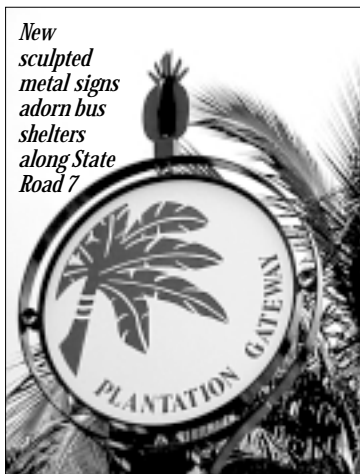
New sculpted metal signs adorn bus shelters along State Road 7